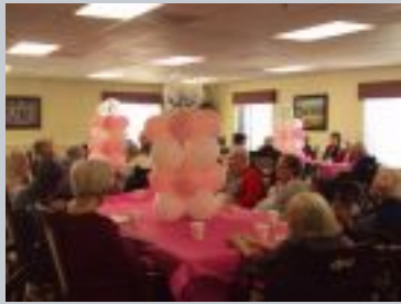
February Birthday Party