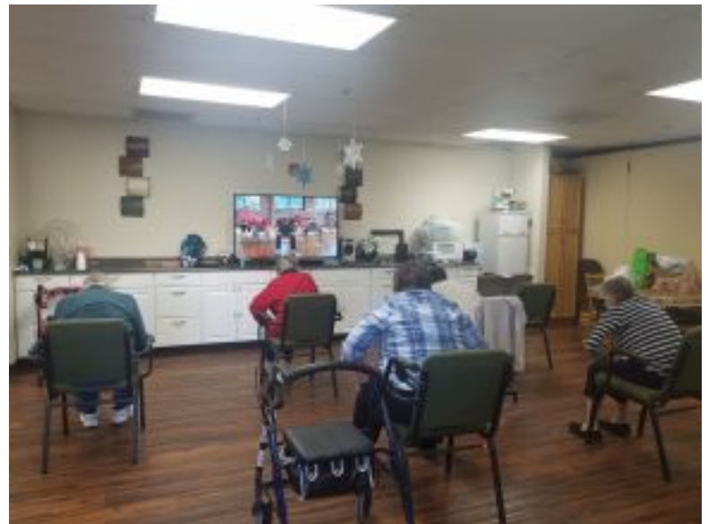
Stronger Seniors Our Residents value physical fitness!